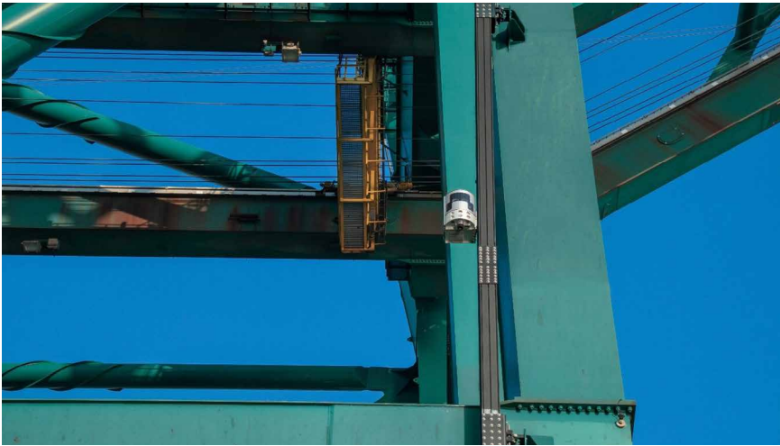
BoxCatcher STS crane OCR connected with crane PLC, travelling up and down crane mounted rails

“MISSING DATA BY LACKING OR MISREADING INFORMATION WILL DRAMATICALLY AFFECT THE OCR SYSTEM PERFORMANCE.”