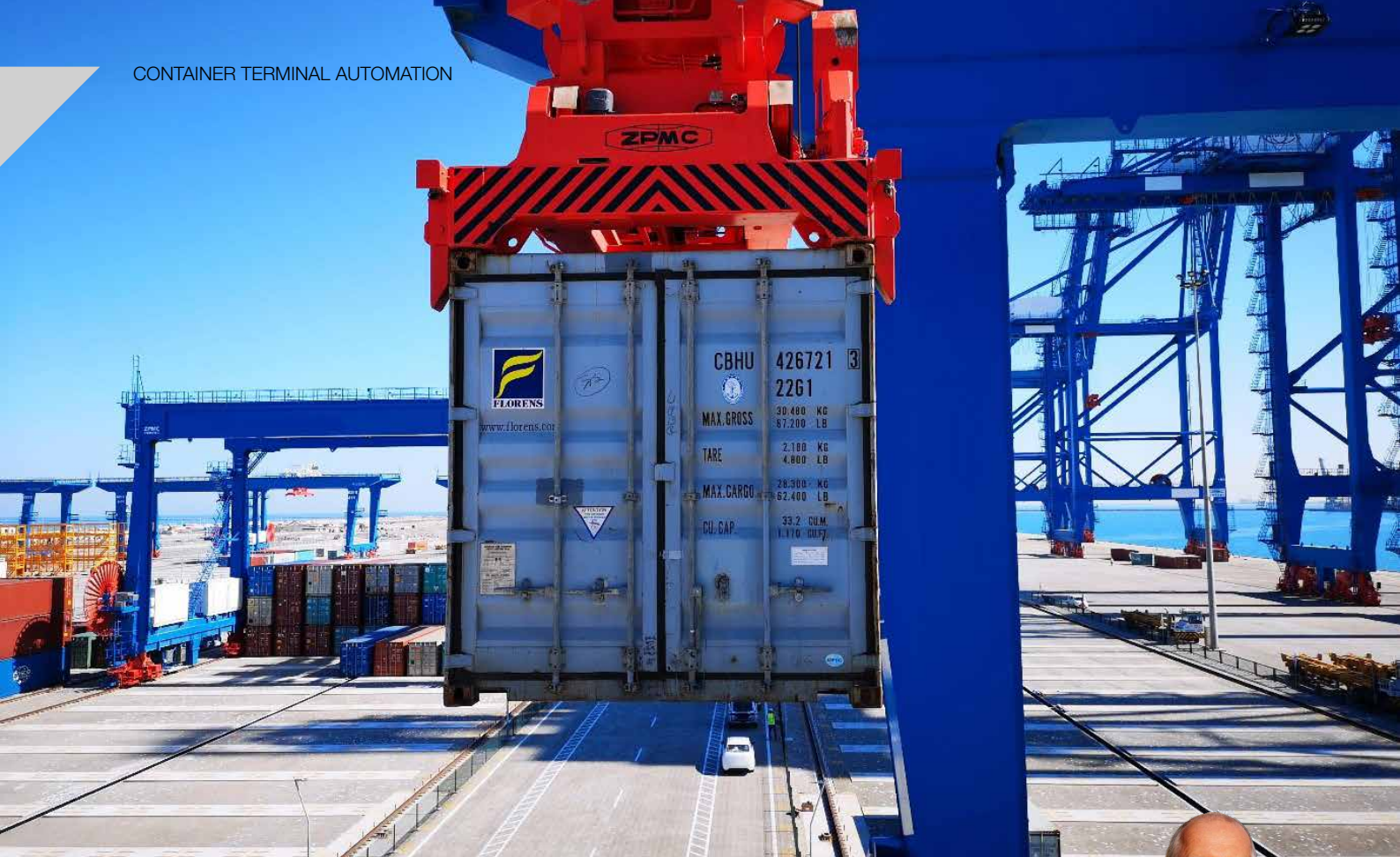
Container reading in RMG crane operations