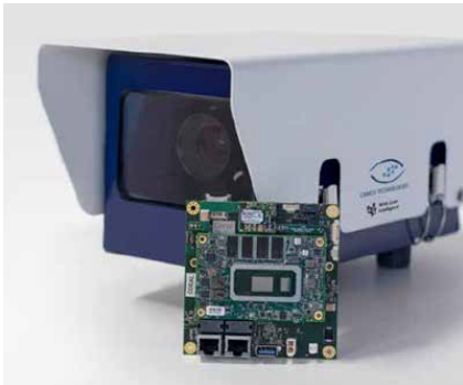
High-end cameras with global shutter, remote focus and embedded AI engine