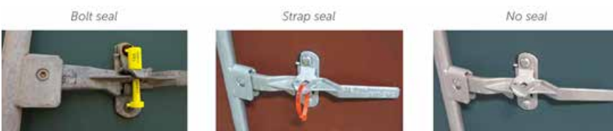
Optical Feature Recognition (OFR): identifying seal presence and type