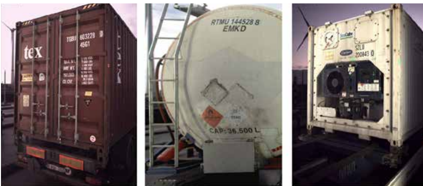
Optical Character Recognition (OCR): reading data strings and labels

When measuring the performance of a stand-alone OCR/OFR system, the hit rate is the most relevant KPI. Whereas the confidence level for each reading is automatically computed by the system, the hit rate is determined through human verification, i.e. by visual check of each picture with the corresponding system read. A typical population size between 250 and 500 images is necessary for the hit rate to be statistically significant. All images in this population are used; no images are discarded, also missed pictures are taken