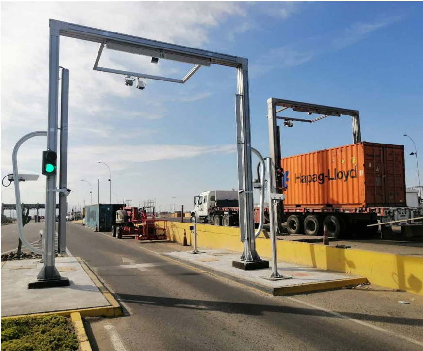
Truck OCR camera portals at Puerto Angamos - Chile

AI-processor. If only a container number or license plate needs registration, a value for money solution might do the thing.