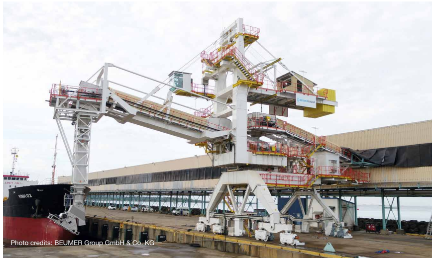
Shiploader before starting into operation

and installation of onshore and offshore pipelines, in addition to other activities. The company also equips ships for their respective jobs in the oil and gas industries.