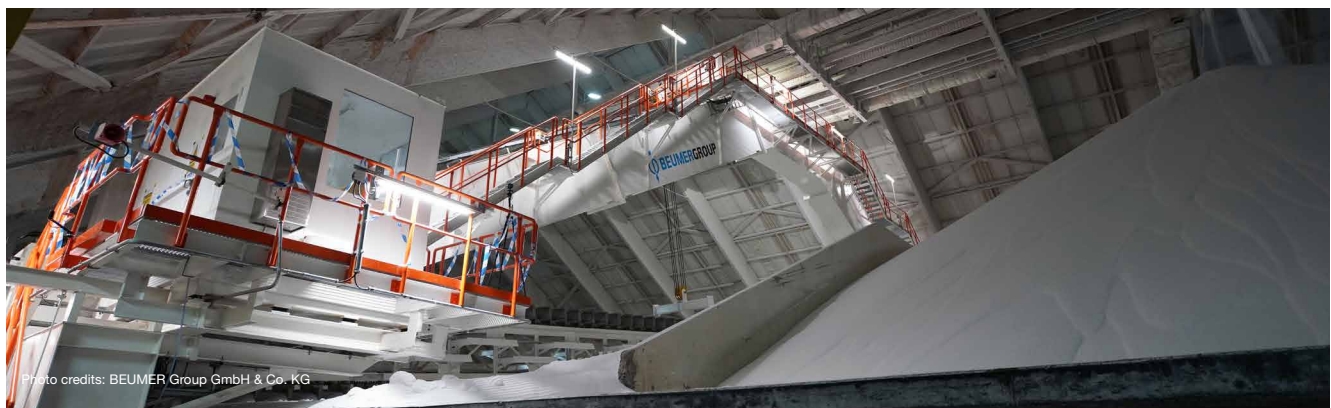
The portal reclaimer removes the bulk material in layers from the side slopes and transports it through a primary crusher to a belt conveyor at a capacity of 600 t/h.

BEUMER and PBJV were up for the challenge, and, in close cooperation, developed installation drawings and procedures for each work package, in compliance with the strict safety requirements of all parties involved.