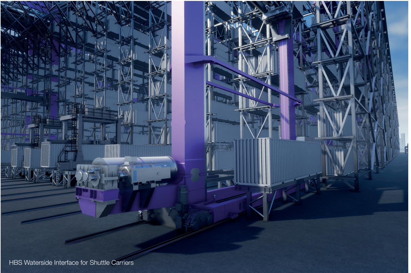
HBS Waterside Interface for Shuttle Carriers

The technology is very modular and can be tailored to either brownfield or greenfield sites. It can also be easily linked to straddle carriers, auto shuttles, terminal tractors and autonomous trucks. We see a big market for brownfield retrofits as the HBS is so compact it can absorb a lot of capacity in a small land footprint enabling minimal business interruptions when the build phases come on line, the HBS can also be expanded step by step while the port is in operation, as the construction site takes up very little space.