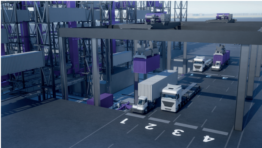
Automated Truck Loading Interface