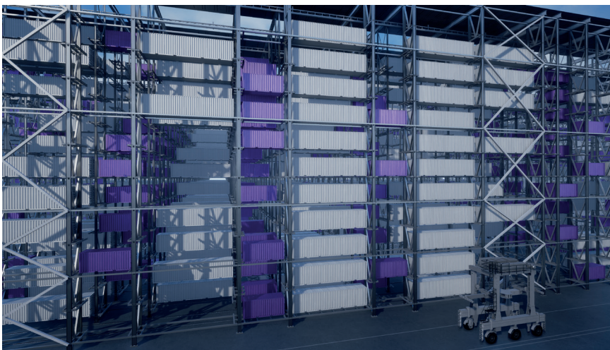
11 Stories HBS System with Shuttle Carrier

and retrieval operations are carried out by stacker cranes. Similar to current spreader operations, containers are picked from above by standard twistlock units. The stacker cranes pick up the containers at the ends of the respective storage aisles from the corresponding transfer positions or place them there again.